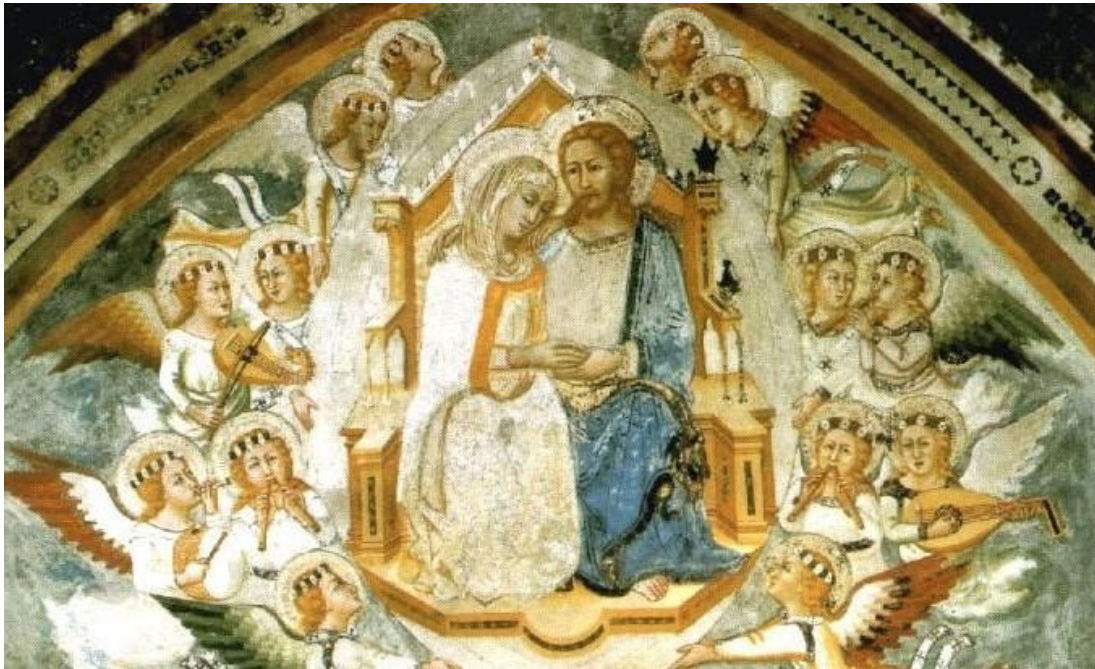
Icon of Christ, the Bridegroom and Mary, the Bride Church from Sacro Speco

IV. Glory be to GOD the Father! Glory be to GOD the Son! Glory be to GOD the Spirit! Glory to the Three in One. + Amen.